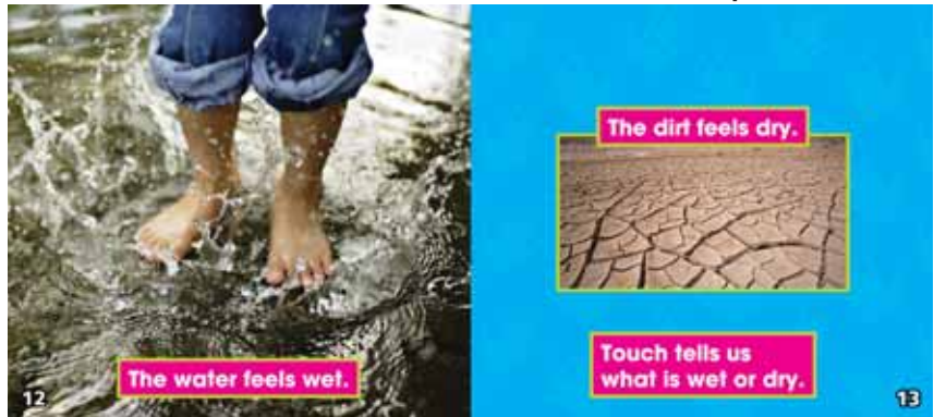
Sample taken from Touch

TOUCH ©2013 RLB 978-1-61913-313-6 PB 978-1-61913-318-1 DEWEY 612